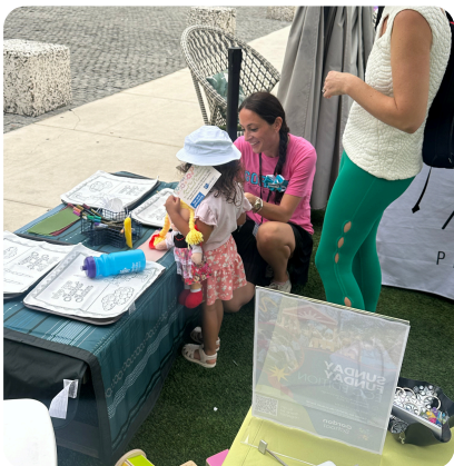
Mom Collective Event