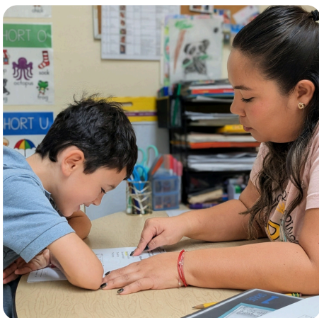
Tikvah 1 st Grade