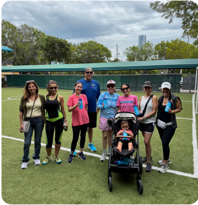
Schvitz and Schmooze

The past few months have been a whirlwind of activity, growth, and community building at the Center for Jewish Life at Beth David. We've seen incredible events, meaningful programs, and inspiring moments that have brought our community closer together. Here are some highlights :