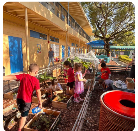
Garden Patch Enrichment