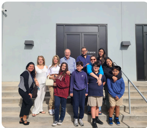
7 th grade