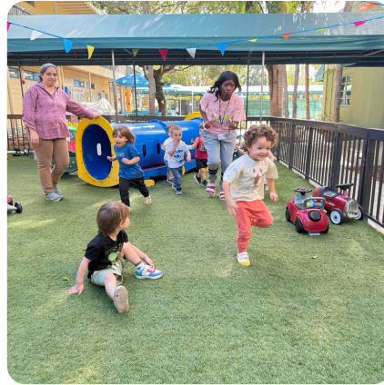
Snow Much Fun Camp